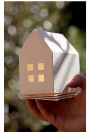
by Maya McDonnell.

The editors and contributors are available for interviews and photoshoots, and review copies of the book can be supplied on request – please contact Kelly Eijdenberg at kelly@ingraphic.com.au or 0407 167 356.